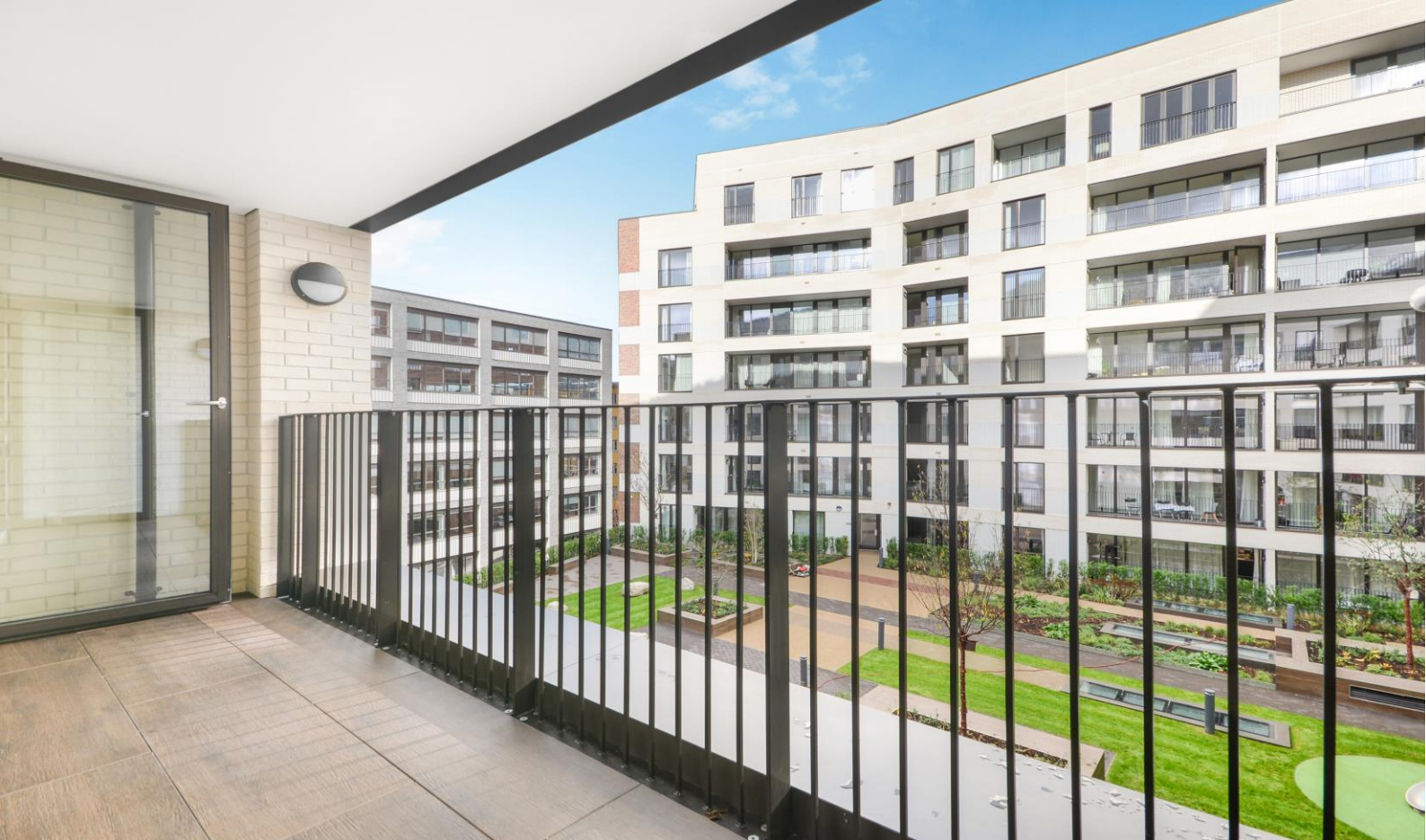
ROSEWOOD BUILDING, GORSUCH PLACE, LONDON E2