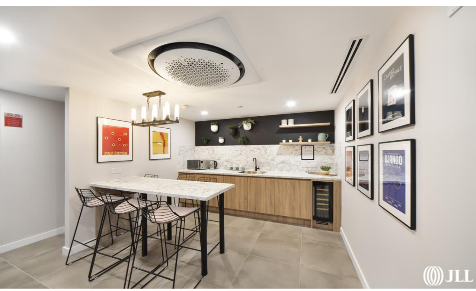
RIVER APARTMENTS, GILLENDER STREET LONDON E3