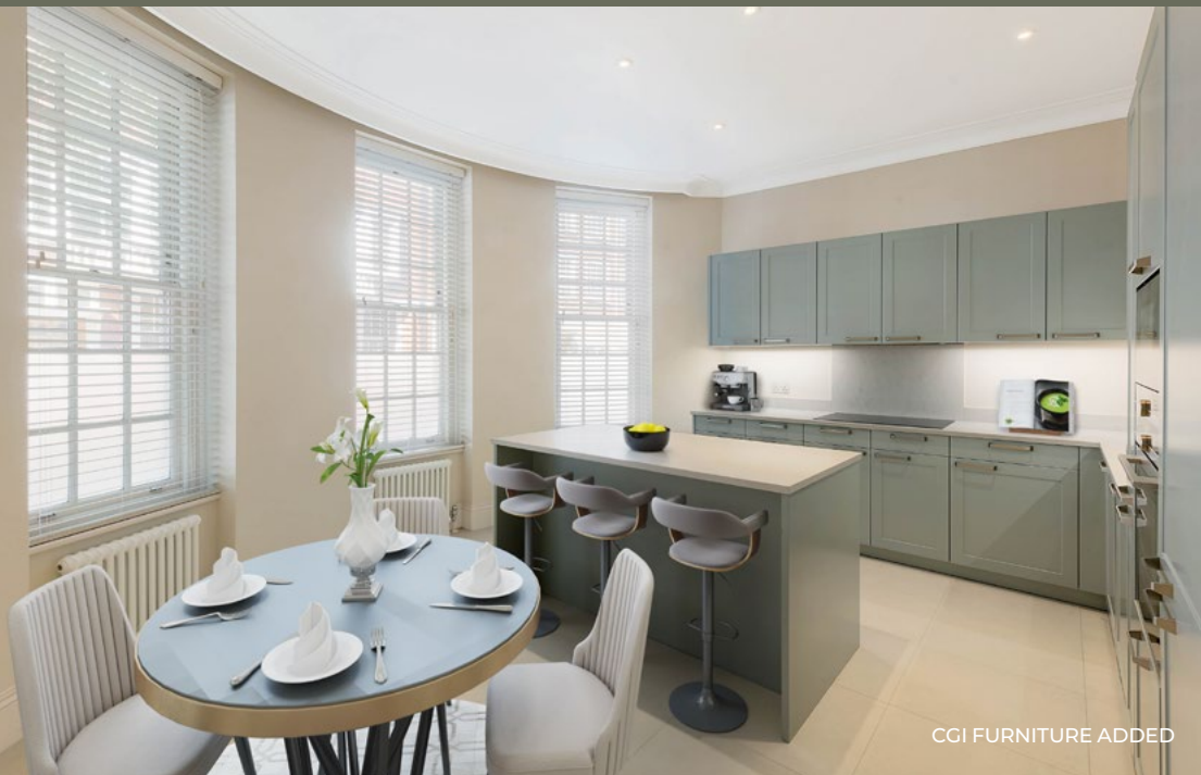
CGI FURNITURE ADDED