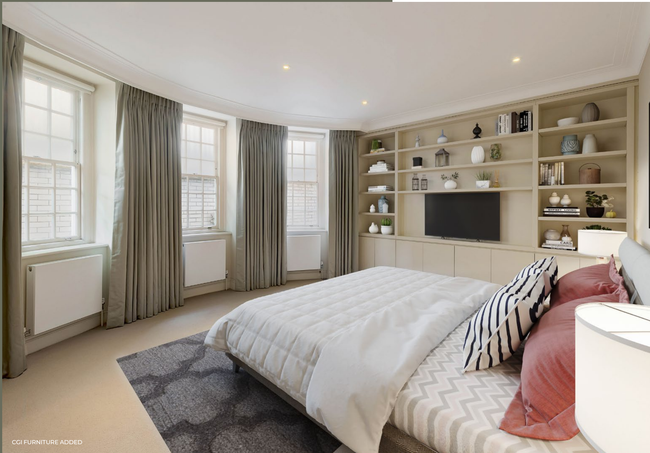
CGI FURNITURE ADDED