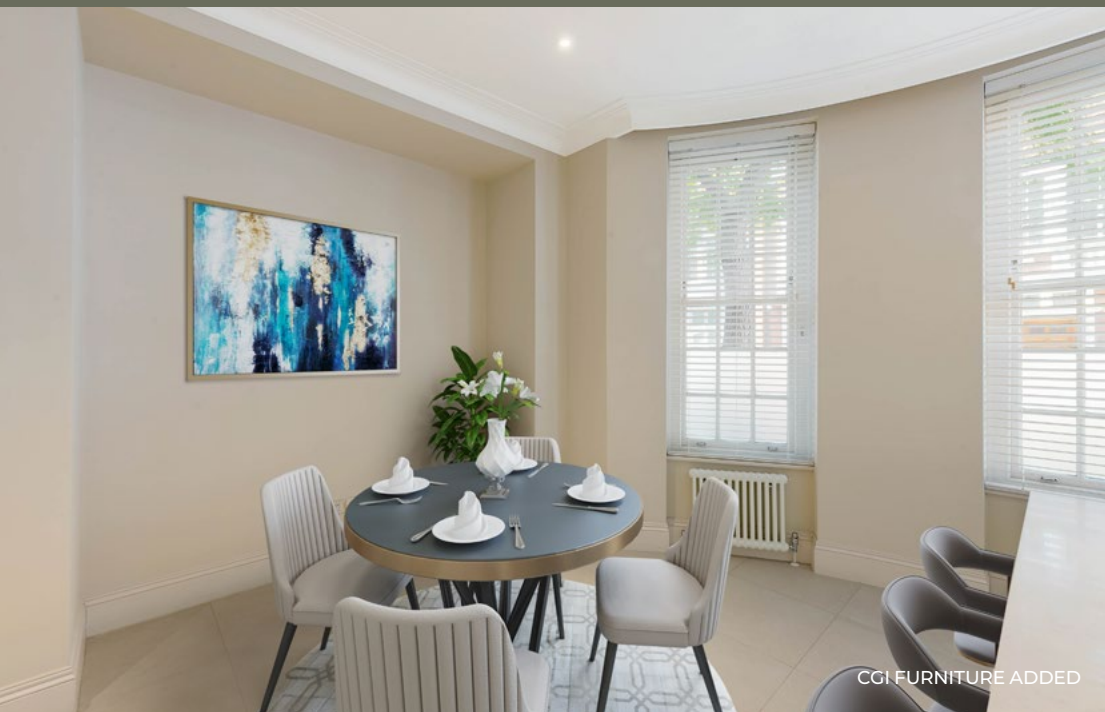
CGI FURNITURE ADDED

Sloane Court East lies just to the west of Lower Sloane Street and is just moments away from the Kings Road and Sloane Square.