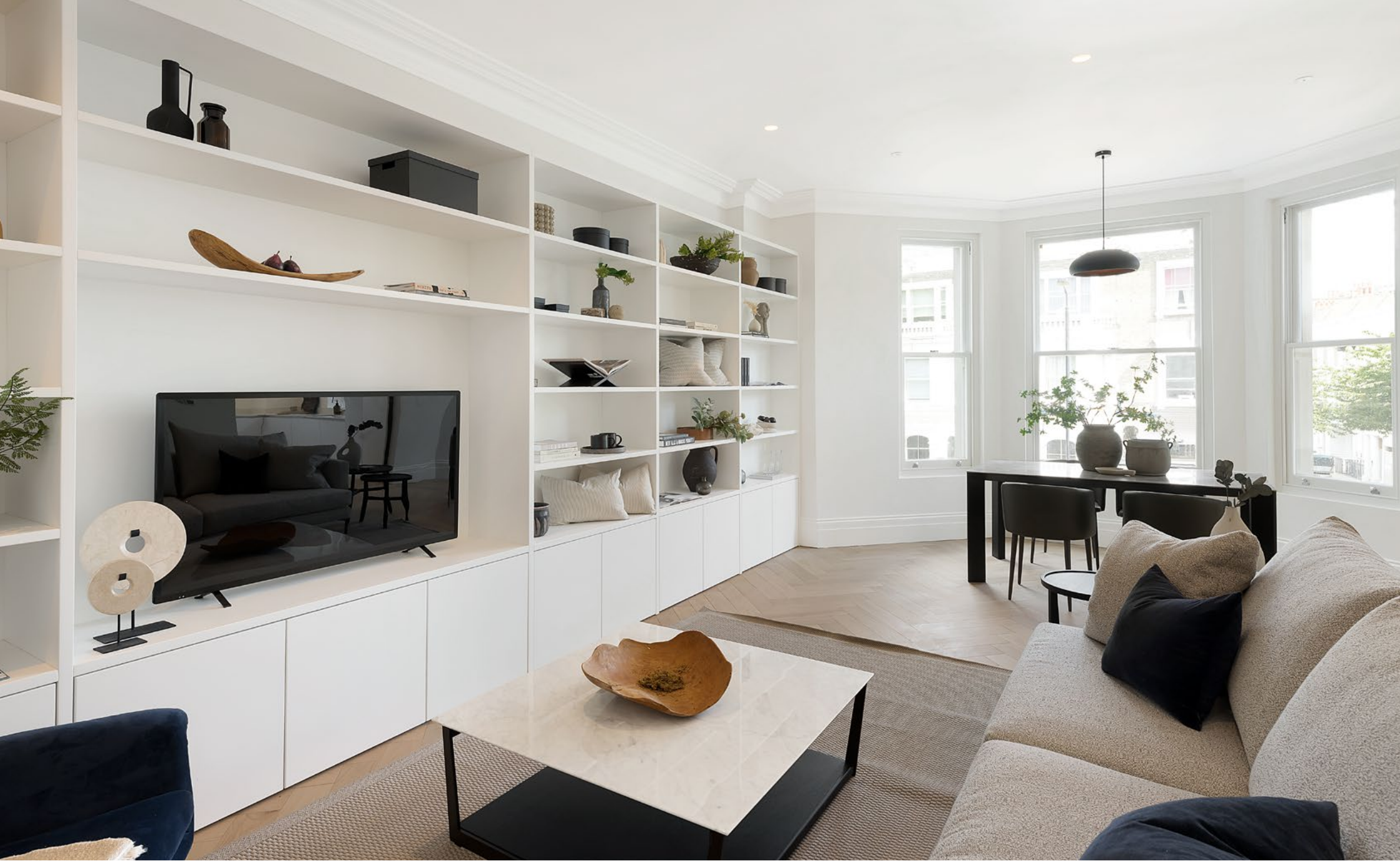
Flat 3 | 26 Redcliffe Gardens | Chelsea SW10