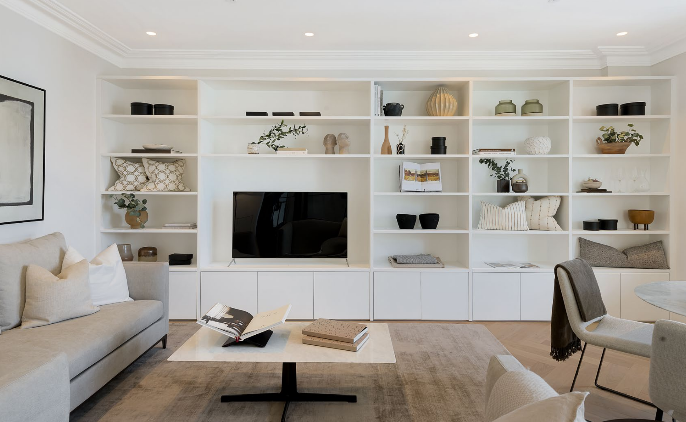
Flat 4 | 26 Redcliffe Gardens | Chelsea SW10