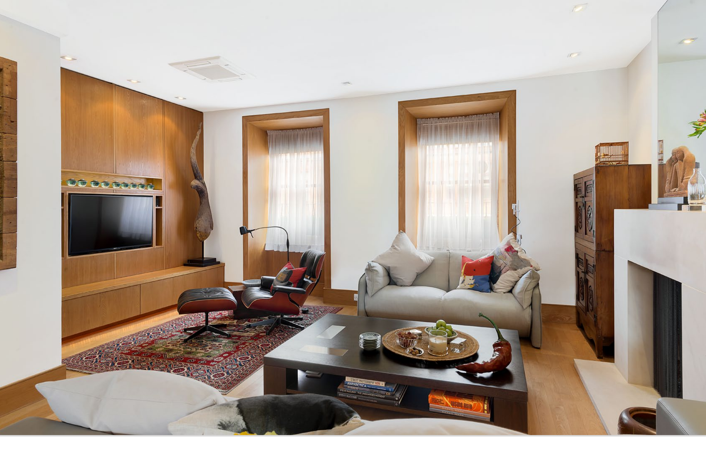
HANS ROAD KNIGHTSBRIDGE SW3