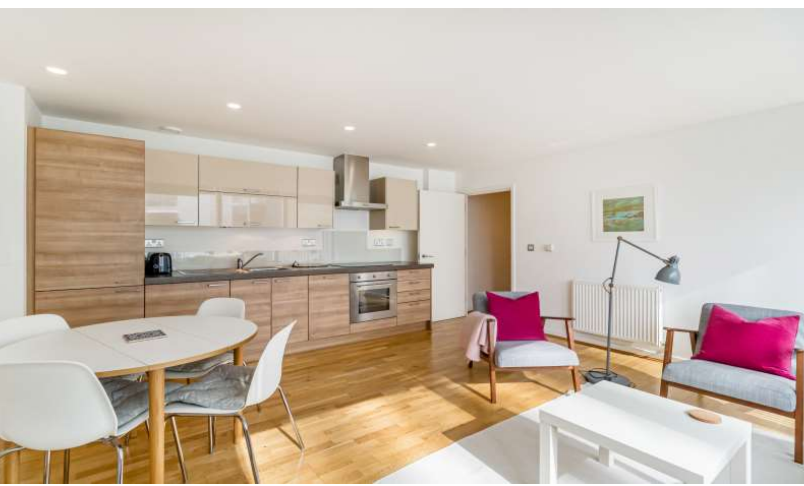
ATRIUM HEIGHTS, 4 LITTLE THAMES WALK, DEPTFORD SE8