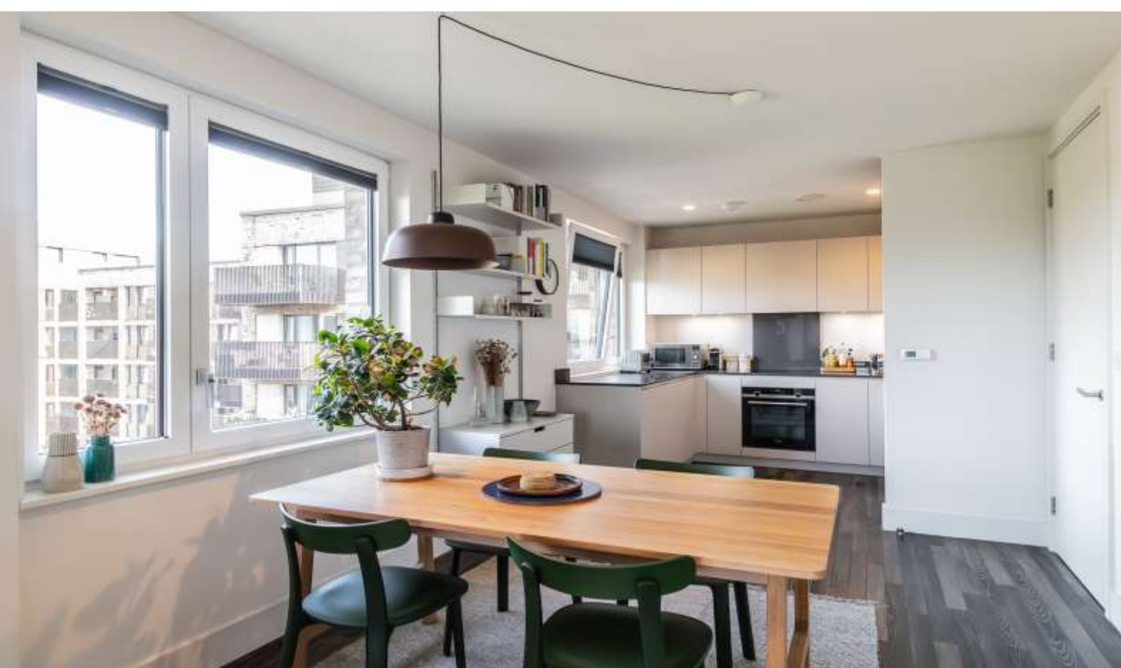
ARBOR HOUSE, MOULDING LANE, LONDON, SE14