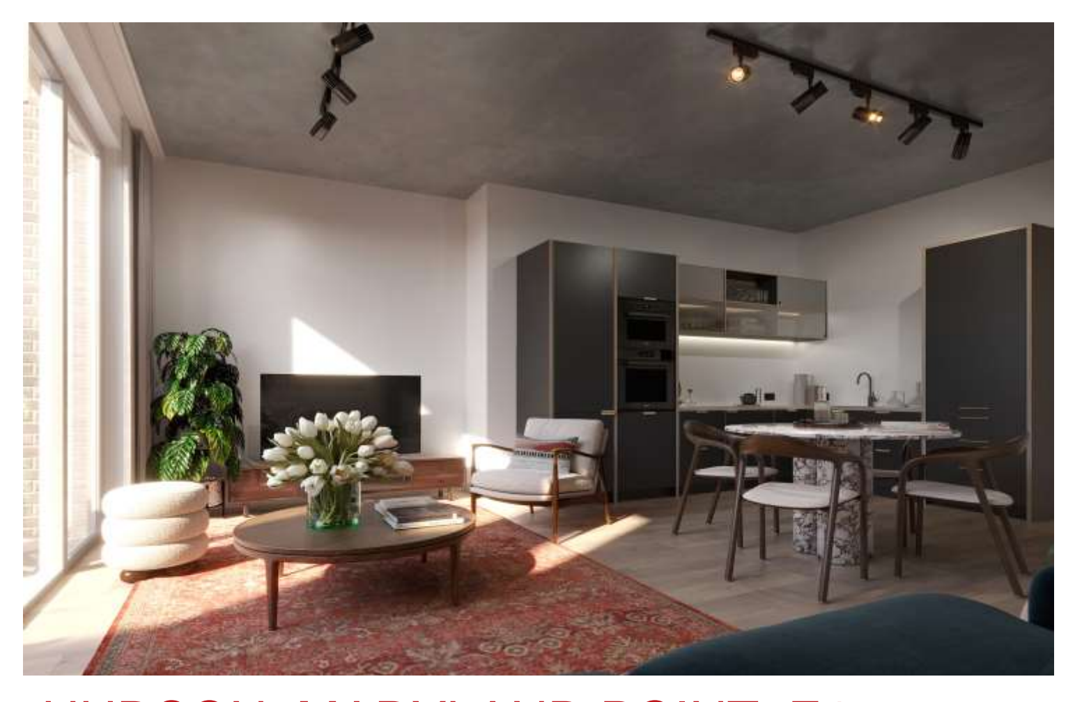
HUDSON, MARYLAND POINT, E15