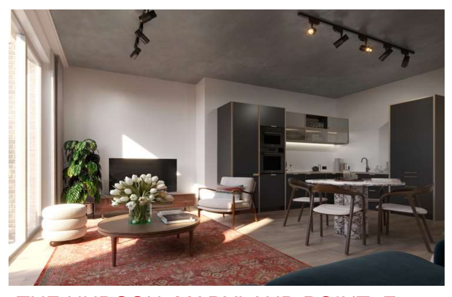
THE HUDSON, MARYLAND POINT, E20