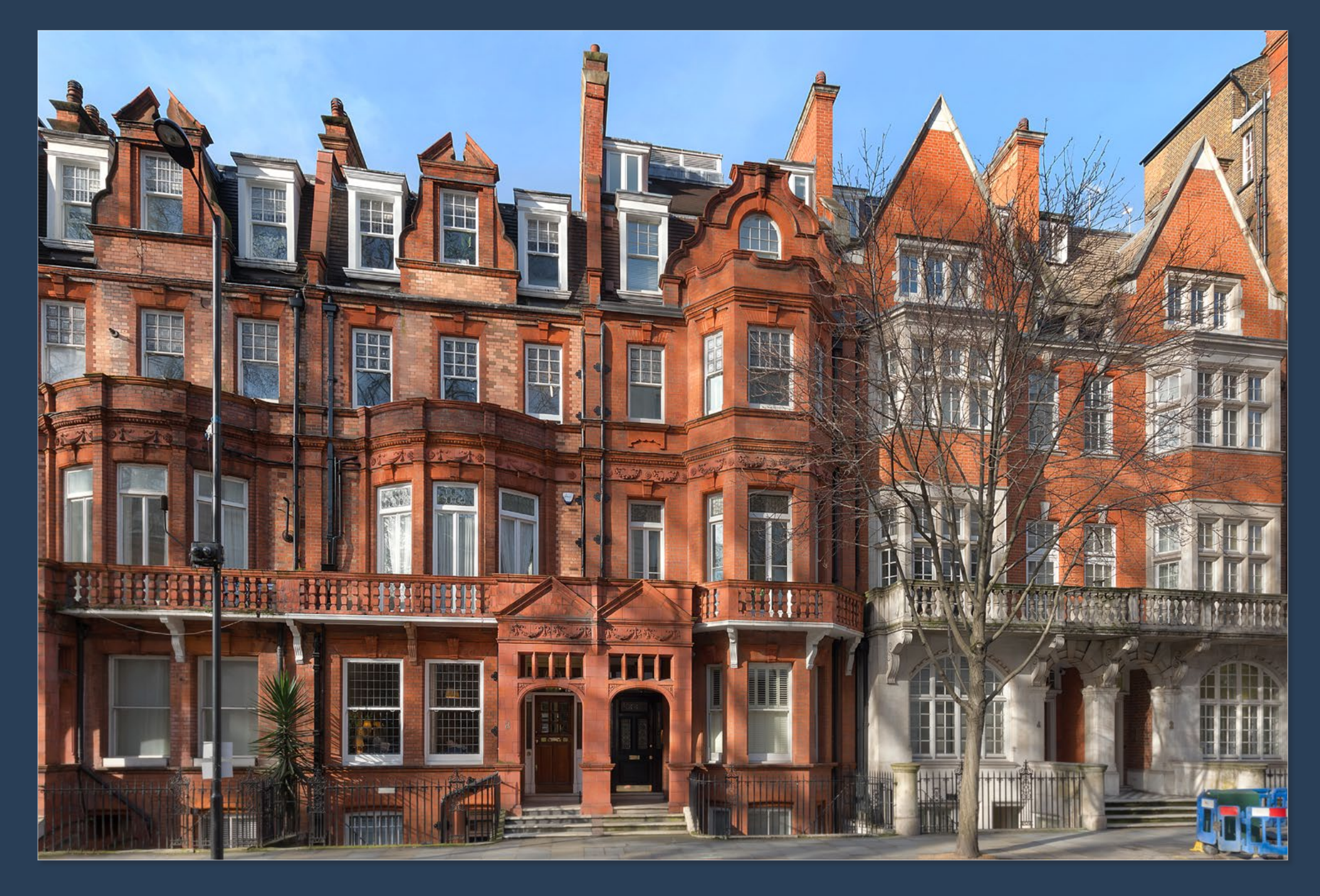
FLAT 1 • 6 LOWER SLOANE STREET • CHELSEA SW1 8BJ