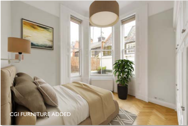
CGI FURNITURE ADDED