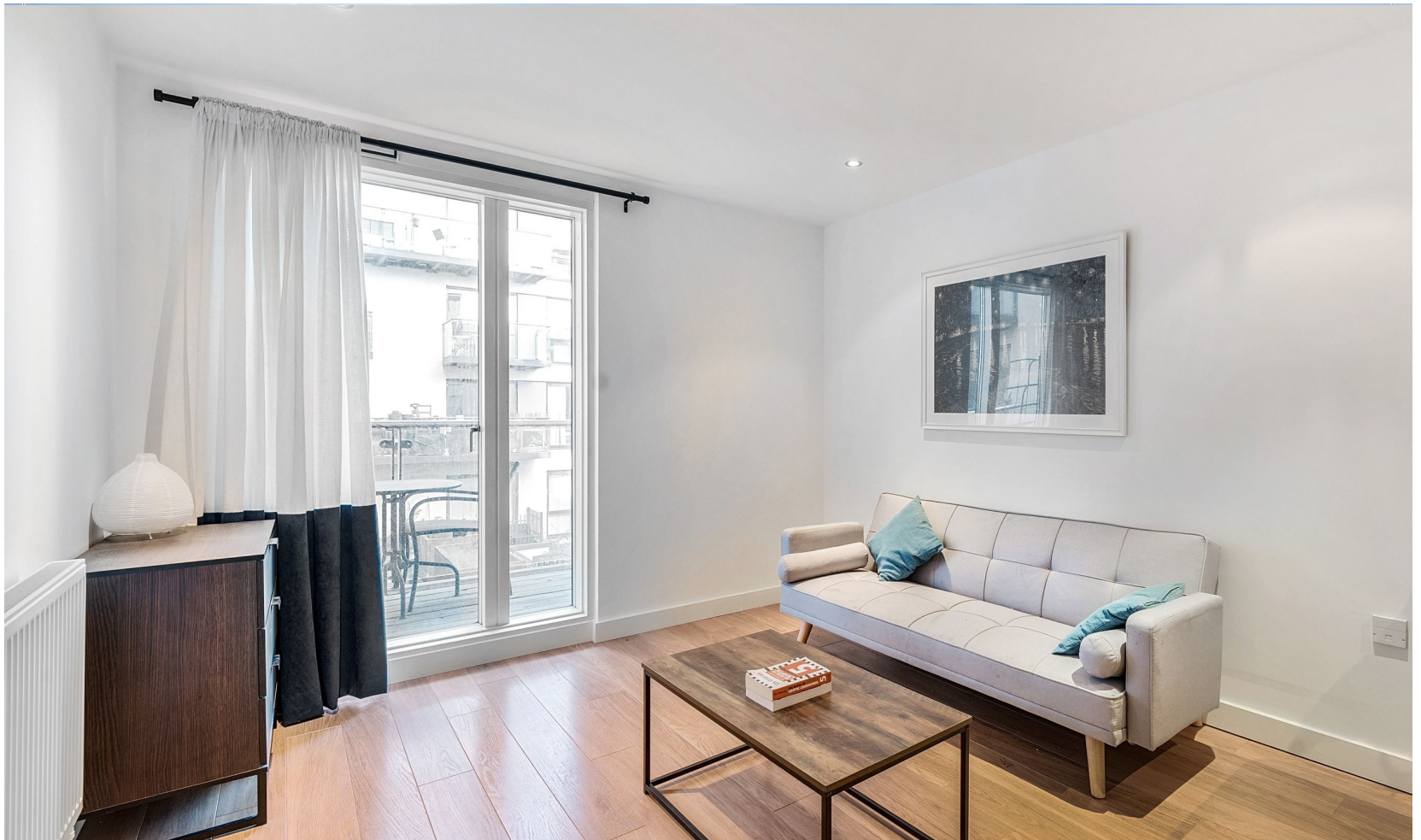
Baquba Building, Lewisham, London SE13 7FF