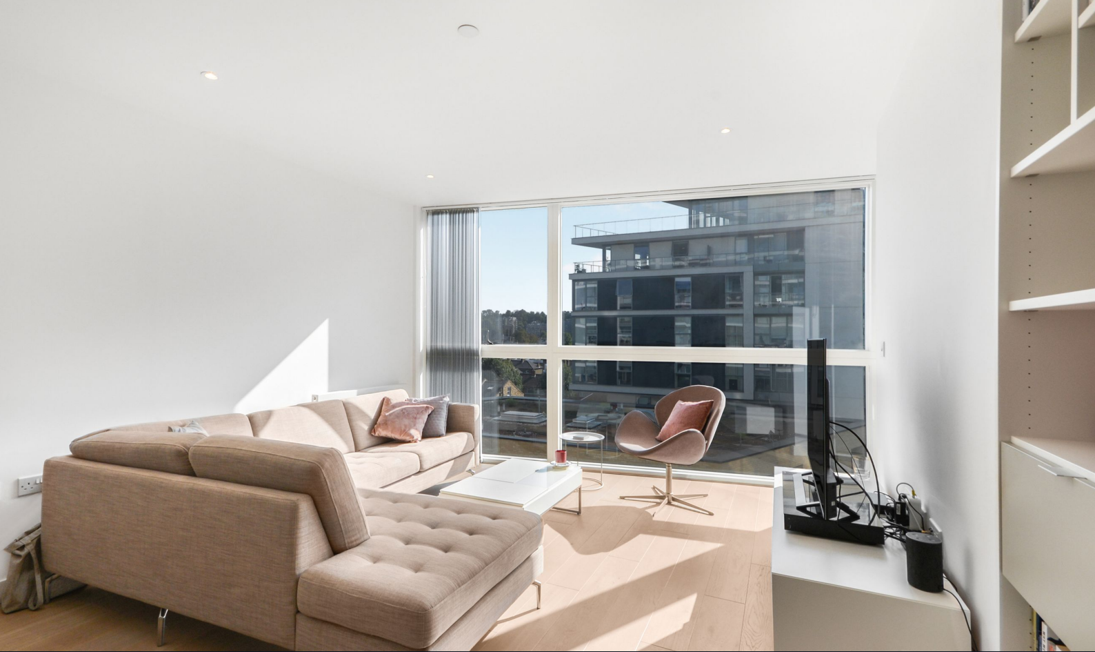
Wyndham Apartments, 65 River Gardens Walk, Greenwich SE10 0TZ